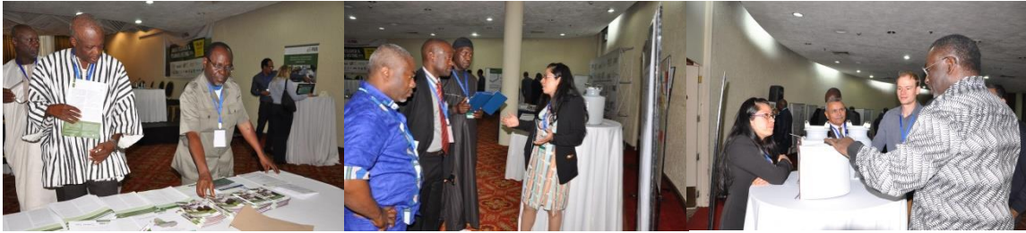
Presentation of publications and machines