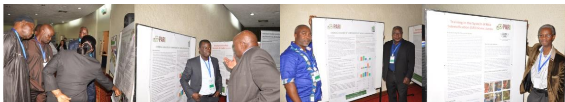
Presentation of posters

A major event during the meeting was Poster presentations and demonstrations of research outputs in which participants displayed posters on research activities and findings. In addition, participants could try out the ICT tools developed under PARI, including an online innovation database, an innovation platform monitor and the e-atlas. During the time devoted for this marketplace, the workshop participants visited and discussed the posters and websites.