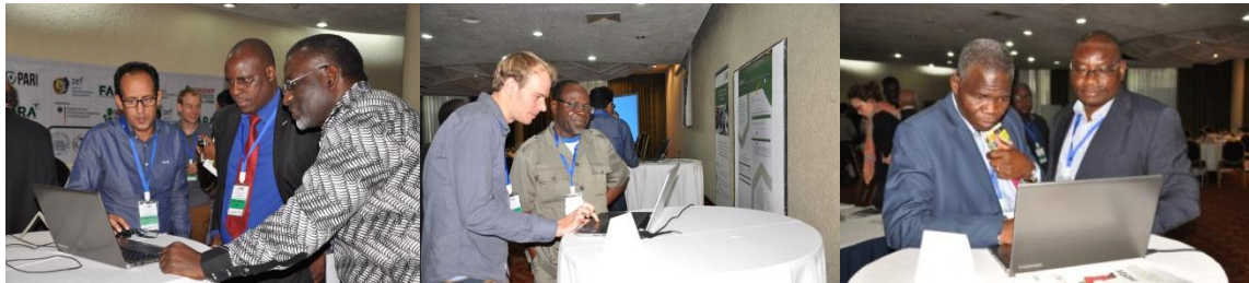
Websites and database shows