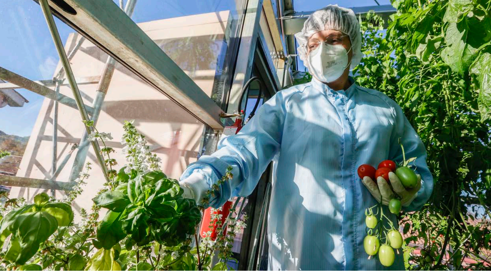
↑ Italy – In a greenhouse, a farmer holds basil and tomatoes grown using hydroponic techniques, reflecting how farmers are utilizing innovation to advance sustainable food production.