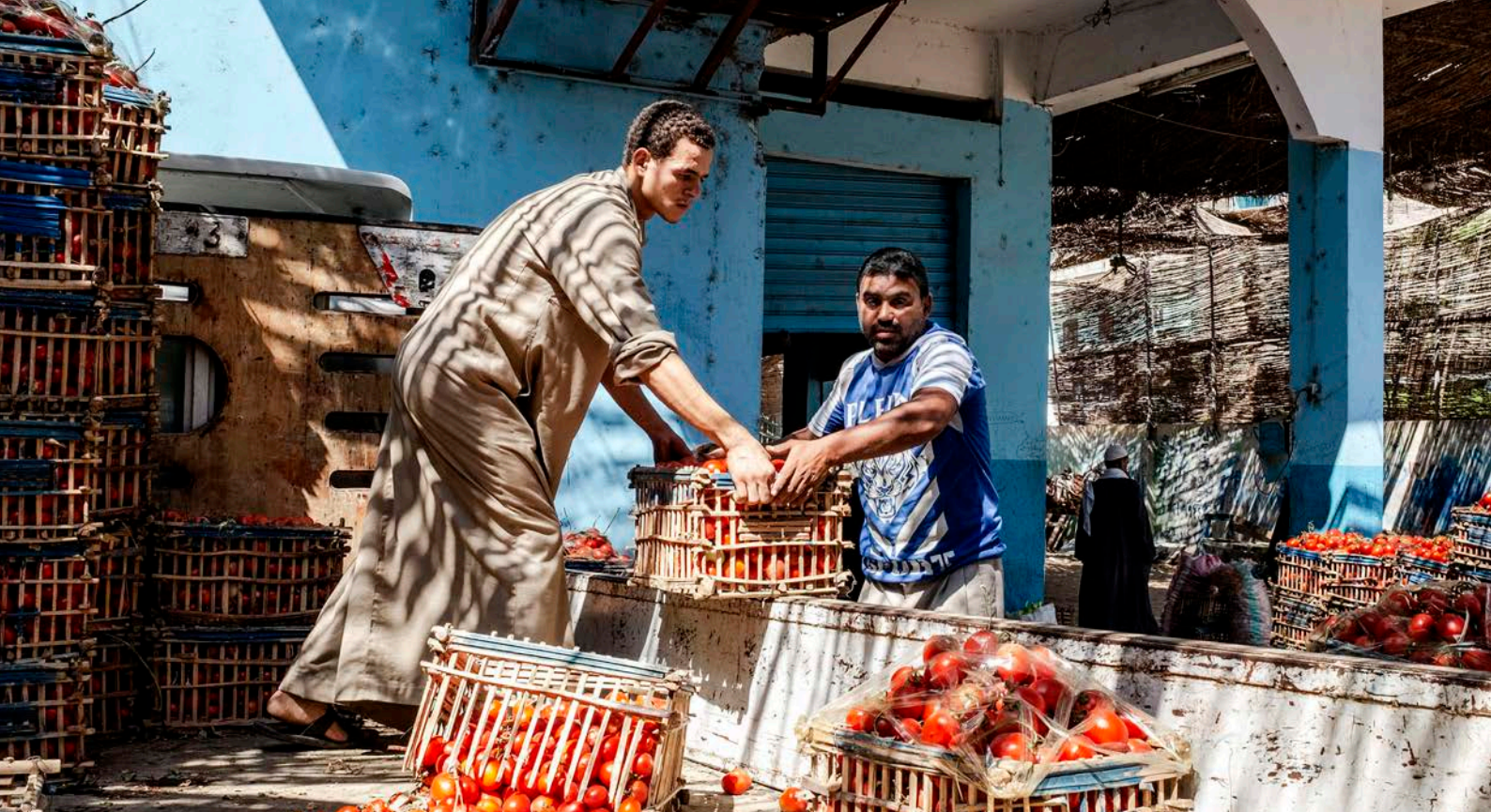
↑ Egypt – Food chain labourers play a critical but often overlooked role in the food supply chain, here shown unloading food for distribution to retailers.