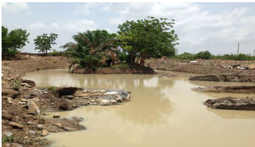
Plate A: The dugout for fish farming at Legacy Girls' College, Akuse, Eastern Region, Ghana

The fish culture system was an excavated area (dugout) close to the entrance of the school. It is highly irregular in shape and its estimated surface area is about 2,100 m 2 . Aside, there is an unexcavated landmass "island" occupying a reasonable portion of the system (Plate A).