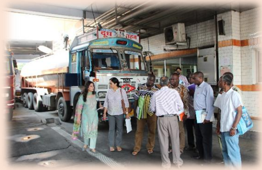
Delivery of chilled milk from district cooperative to Amul plant

The entire value chain from procurement,