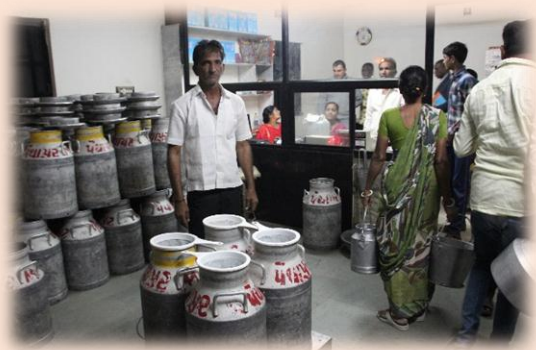
Pethapur Village Dairy Co-operative Society

Founded in 1950 in Anand within the state of Gujarat, Amul is an Indian dairy cooperative that led to what is now known as the white revolution of India, which was spearheaded by Tribhuvandas Patel under the guidance of Sardar Patel and Verghese Kurien. Amul is managed by the Gujarat Co-operative Milk Marketing Federation Ltd. (GCMMF), which today is jointly owned by 3.6 million milk producers in Gujarat.