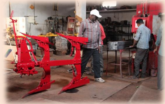
Visit to implements fabrication centre

PARI visited SRISTI is a developmental voluntary organization that seeks to strengthen the creativity of grassroots communities, including individual innovators. It supports eco-friendly solutions to local problems being scouted, spawned and spread by the Honey Bee Network for over 26 years.