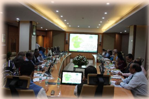
Discussions at NABARD