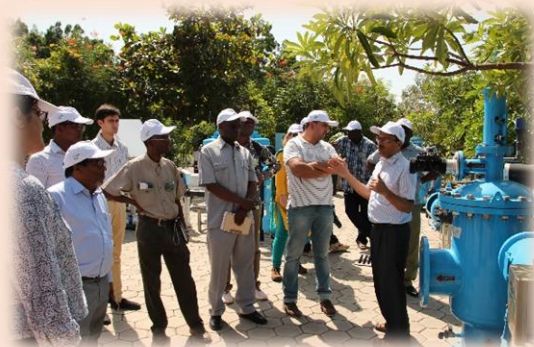
Jain Irrigation Systems

The fertigation system allows for direct application of fertilizer. Drip irrigation may be used even in areas where there is enough water as it represents an efficient method of delivering fertilization. However, 60% of the increase in yield recorded using drip irrigation system is because of fertigation and not the irrigation itself. The precision agriculture system with integrated fertigation and regulatory sensor is economically