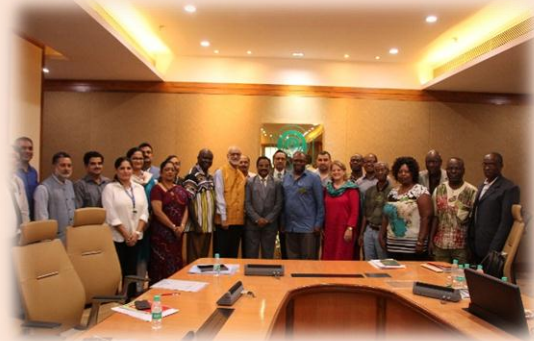
Team members at NABARD

Parliament), NABARD is an apex development financial institution in India and took over the functions of the Agricultural Credit Department (ACD) and Rural Planning and Credit Cell (RPCC) of Reserve Bank of India, and