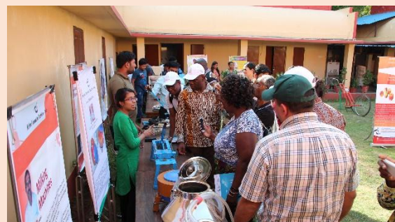
Exhibition at the NIF