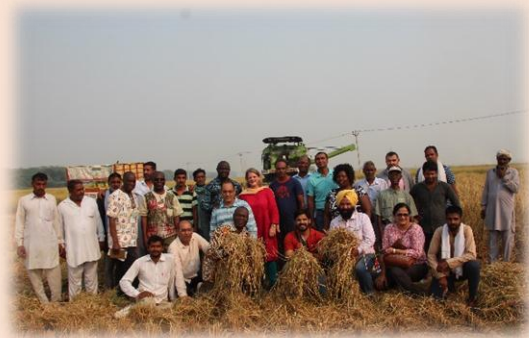
Basmati rice growers of Haryana

PARI visited the Basmati rice growers of Karnal in Haryana and interacted with the Indian farmers, Mandi officials, traders and other stakeholders. The Karnal farmers of Basmati rice mainly harvest by hand in an area of 2,000 ha. Farmers receive input from cooperative, which collaborates with several companies around the world including Syngenta through Kisan Club. India accounts for over 70% of the world's basmati rice production, most of which comes from Karnal. Other areas of basmati rice production in India are in the states of Punjab, Himachal, Pradesh, Delhi and Bihar.