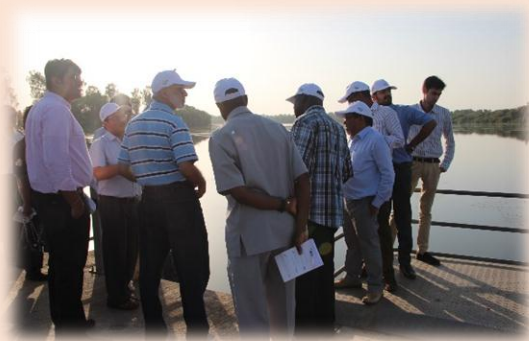
Visit to Jain Dam

JAIN constructed a dam to meet the water requirements of the industries where 50% is used by JAIN and the other 50% given to the government. The total storage capacity of the dam is 2 million cubic meters