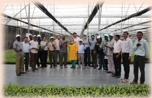
Tissue culture generated banana

The tissue culture facility of JAIN produces 80 million plantlets of banana at full capacity and with semi-automated primary and secondary hardening facilities as well as independent R&D and virology labs. Similarly, a modern Bio- tech lab equipped with all modern and state-of-the-art facilities meet the needs of continuous genetic improvement and validation program in cultivators of onion, banana, mango, pomegranate etc.