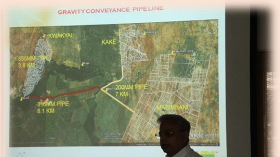
Location of Jain's project in Rwanda

Another project was executed in Rwanda in partnership with Rwandan Agricultural Board (RAB). The total area of the project was 200ha and located around the border with Uganda. Of