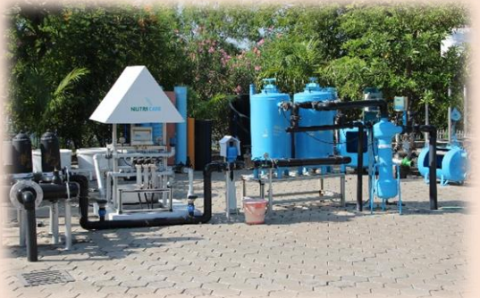
Jain Irrigation packages

JAIN Irrigation is also the largest manufacturer of plastic pipes in India covering a wide range of