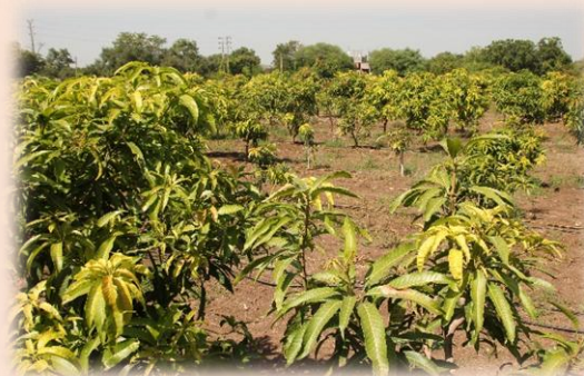
Ultra-High-Density Orchard - Mango

JAIN has developed an improved system of growing mango using a technology of continuous pruning in which the mango never grows more than 1.2M but is surrounded by taller mangos that serve as umbrellas to control light. The system is named Ultra High-Density Orchard (UHDO). The mango is hand harvested and is the world highest production recorded 27 metric tons per ha produced after the third year of planting. The national average is 6 tons/ha.