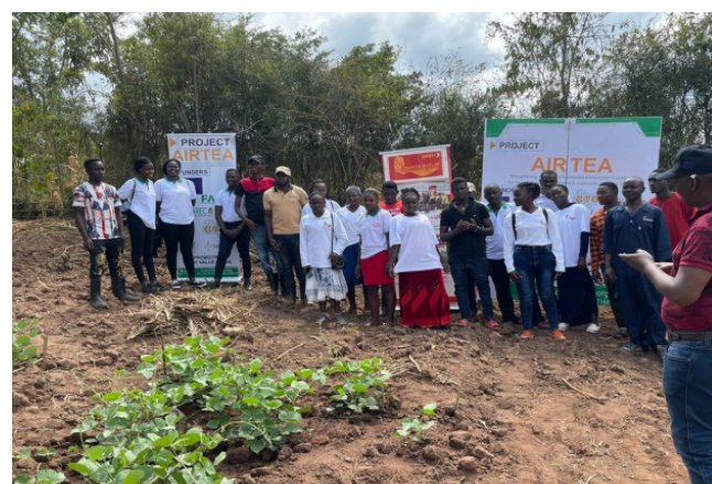
Figure 2: Farmer training at a model Dairy facility in Mityana, Uganda

The new MSPs enable smallholder farmers to access market information, decision-making tools, and e-learning modules in real-time, which was adopted by 213 farmers (90 youth, 58 women, and 65 men). Farmer training facilitated the integration of digital solutions in the green dairy farming and horticulture (Figure 2).