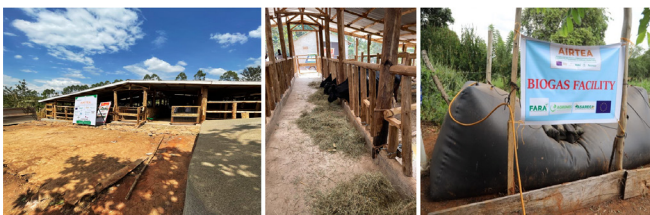
Figure 3: A Physical MSP as Dairy Innovation Centre (DIC) facility at a model farm in Gomba, Uganda

The establishment of Dairy Innovation Centres (DICs), in Mityana, Gomba and Wakiso districts bolstered farmer training and innovation at all nodes of the dairy value chain. These centres became central hubs for value-added production, including biogas, silage, and organic fertilizers (Figure 3).