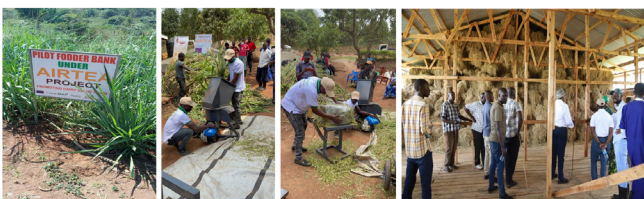
Figure 4: Forage production and feed conservation

Farmer-led demonstration plots for horticulture and forage productions were at the DICs facilities. Over 1,000 kilograms of elite forage is produced monthly, providing enough conserved feed resources for the livestock even during prolonged 3-month dry spells. Moreover, the DICs facilitated knowledge-sharing through 270 visits, fostering community engagement and the adoption of zero-waste practices (Figure 4).