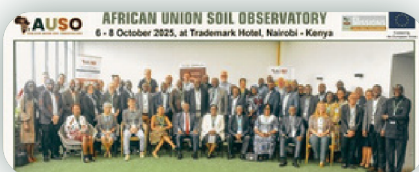
AUSO Project Launch