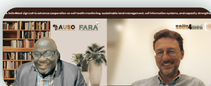
AUSO & Soils4Med LoA Agreement Signing