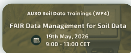
Data Management Trainings