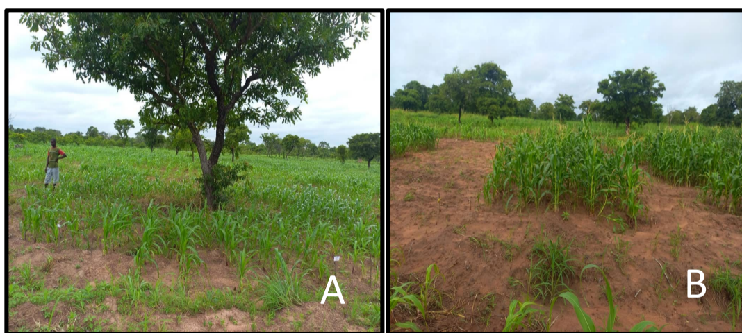
Figure 1. Maize plants under tree canopy (A), maize plants outside tree shade in Ghana (B)